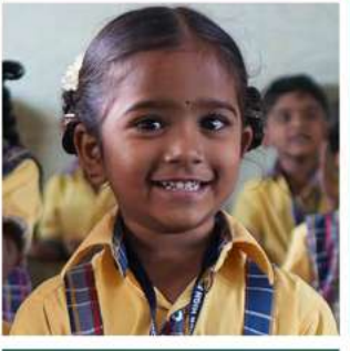
03 colleges impacted