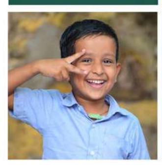
72 youths impacted through skilling initiatives