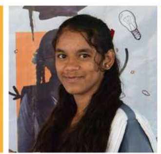
change makers trained through social internship